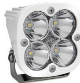
Squadron Sport, LED Spot, White