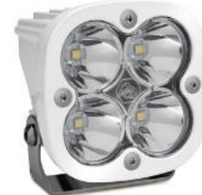
Squadron Pro, White, LED Work/Scene