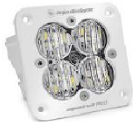
Squadron Pro, White, Flush Mount, LED Wide-Cornering