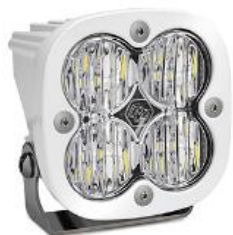
Squadron Sport, LED Wide Cornering, White