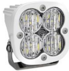
Squadron Pro, LED Wide Cornering, White