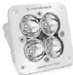
Squadron Pro, White, Flush Mount, LED Work/Scene