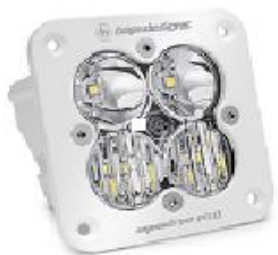
Squadron Pro, White, Flush Mount, LED Driving/Combo