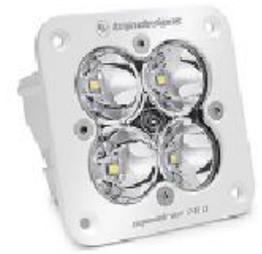
Squadron Pro, White, Flush Mount, LED Spot

PO Box 3315 Thornton NSW 2322. Unit 1, 13 Elwell Close (Cnr Bowden Way), Beresfield NSW 2322. Tel 02 4966 8020