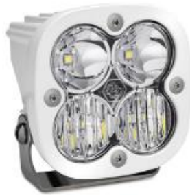
Squadron Pro, White, LED Driving/Combo