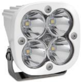
Squadron Pro, White, LED Spot