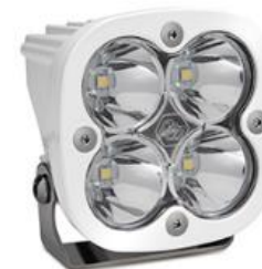
Squadron Sport, LED Work/Scene, White