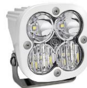
Squadron Sport, LED Driving/Combo, White